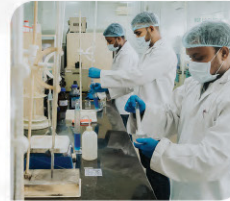
Research & Innovation