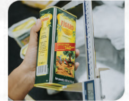
Quality & Compliance